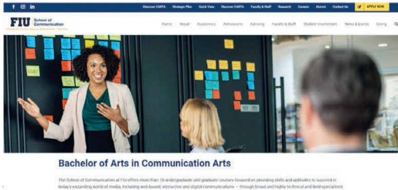
Fig. 1. The School of Communication at FIU. College of Communication, Architecture + the Arts (CARTA)

their leadership cultivates vigorous debate in the classroom and throughout the academic and professional world (The School of Communication at FIU, 2023).